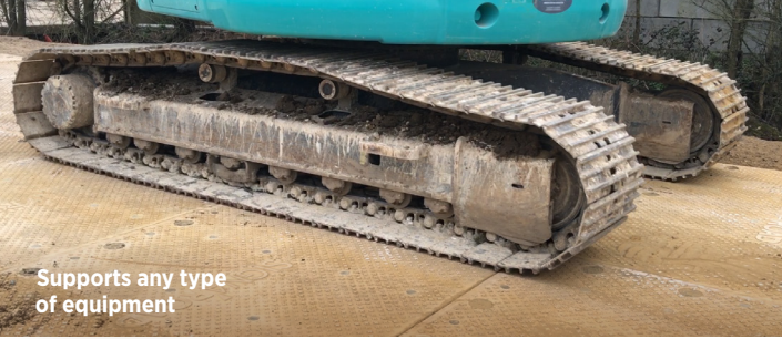
Supports any type of equipment